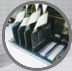
SPT510 - 35PL Printhead