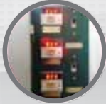
3 way intelligent heater